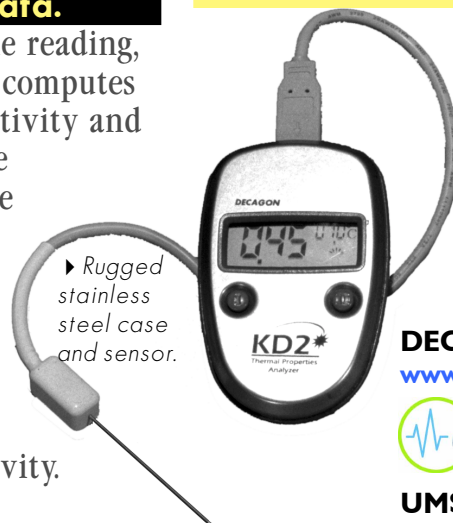
▶ Rugged stainless steel case and sensor.